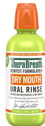
Therabreath Dry Mouth Rinse