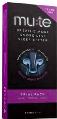
Mute Nasal Dilators