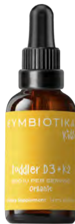
Vitamin D Toddler