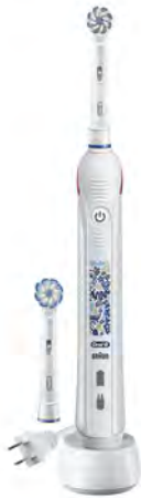
Oral B Kids (3 and up)