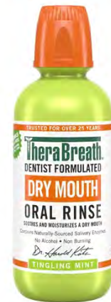
Therabreath Dry Mouth Rinse