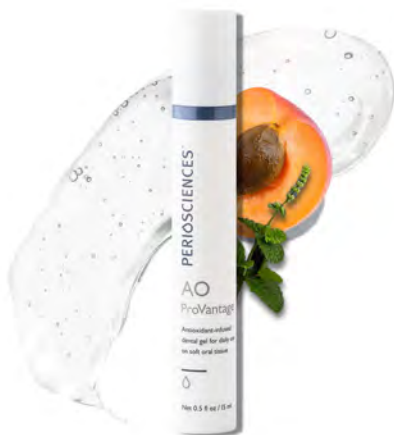
Periosciences Gum Gel