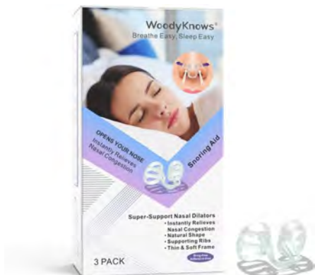
Woody Knows Nasal Dilators