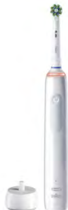
Oral B Toothbrush