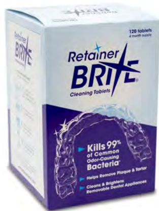
Retainer Brite Tablets