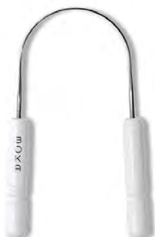
Boka Metal Tongue Scraper