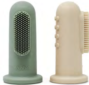
Mushie Finger Brush (0-1)