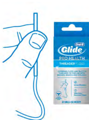
Threader Dental Floss