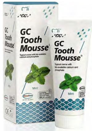
GC Tooth Mousse