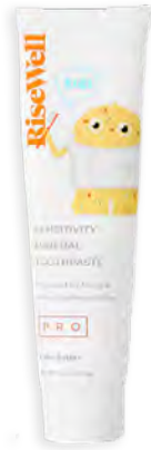
Risewell Pro Kids