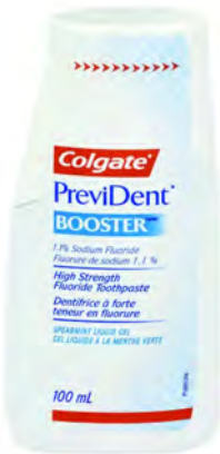
Prevident 5000 (prescription or in office only)